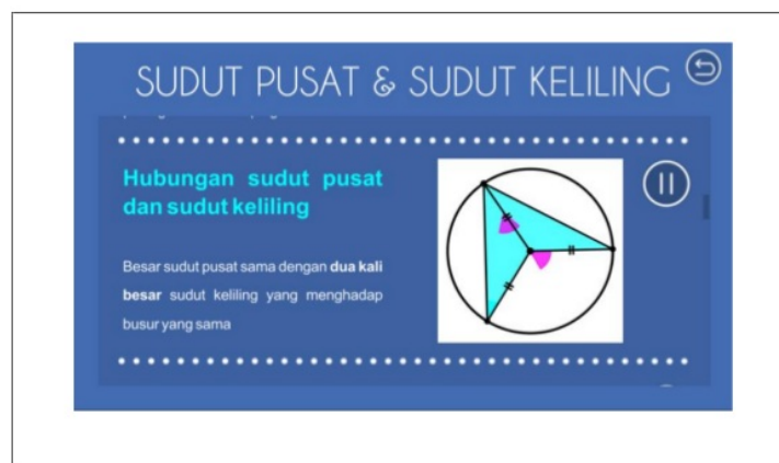
Figure 2. Visualization of materials in "Circle".