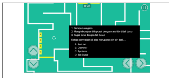
Figure 3. Visualization of Games in “Circle”.

Interest is one of factor that can affect person to do something activity. As Dewey [7] has expressed interest in being “engaged, engrossed, or entirely taken up with some activity”. Other opinions also defines interest as a motivational variable that refers to the involvement of individual within a particular class of objects and activities [8]. Furthermore, Ainley, Hidi, and Berndorff [9] divides the interest into three types, namely individual interest, situational interest, interest in the topic. Individual interest is regarded as individual inclinations to deal with specific stimuli, events, and objects. Situational interest is caused by certain environmental aspects. While the interest of the topic is caused by certain topic or subject.